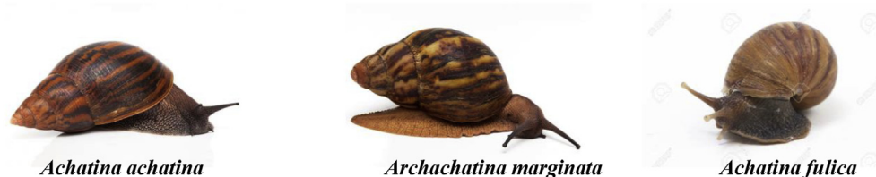
Figure 1. Species of Achatina achatina , Archachatina marginata and Achatina fulica .

absorbance was recorded using atomic absorption spectrophotometer system Model Nov AA 400p (Analytik Jena GmbH, Jena, Germany) against a blank. During the Ca determination, 1 mL of lanthanum chloride was added to the original solution to unmask Ca from Mg. The concentration of each mineral (ppm) was recorded and the total mineral concentration in mg/100 g was then calculated according to Eq. (3) (Akinnusi et al., 2018):